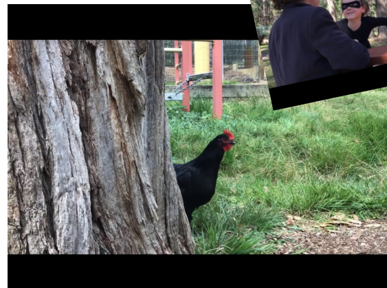
Emerald the chook in her debut role in "Chicken Trouble in Spy School"