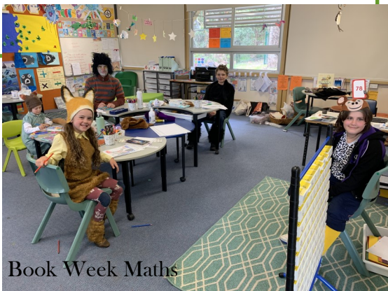
Book Week Maths