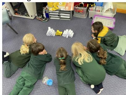
Looking at the different shaped honeycombs students made