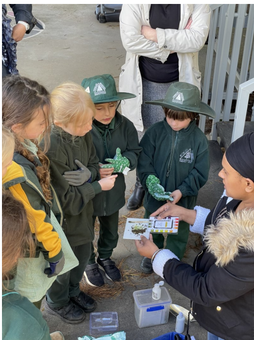
Learning to read soil pH