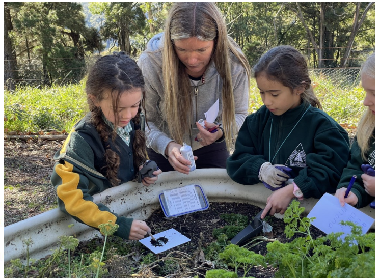
Testing the soil in the Vegetable garden