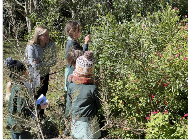
Looking to see what Bee species we can find

Students had a wonderful day learning about the important roles that bees play in our ecosystems. Educators from Richmond Agricultural High School visited to share their knowledge about bees. Students learnt about how the shape of the honeycomb is useful and tried making honeycomb with other shapes. They learnt about the importance of healthy soil and about bee communication.