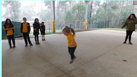
Rainy day Jumping