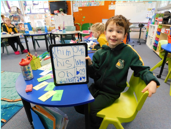
Literacy and Numeracy with our Kindergarten Students