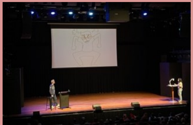
One of the students favourites—Remy Lai