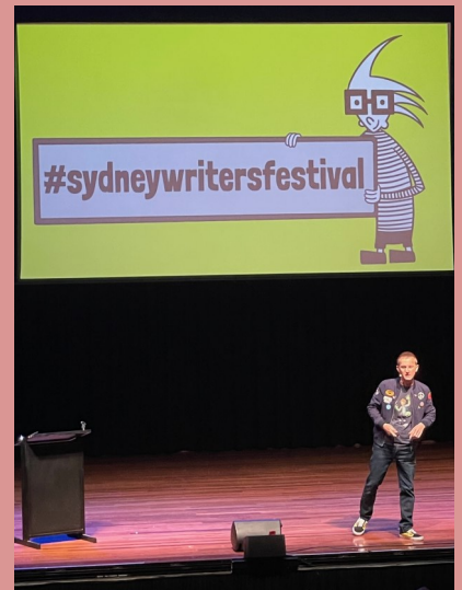
Waiting for it all to begin..