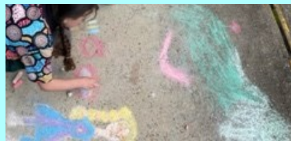
Mrs Keep portrait

Students have been busy creating some amazing chalk artworks at lunch time. Our recess area is looking very colourful now!