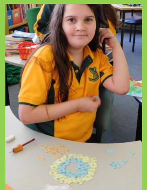
Recycled Waste Art