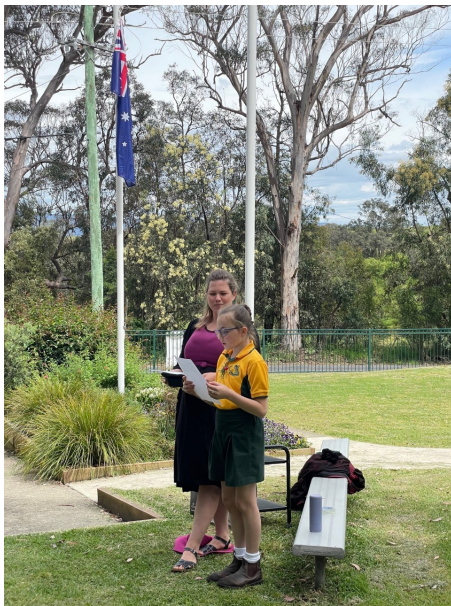
Remembrance Day Service 2022